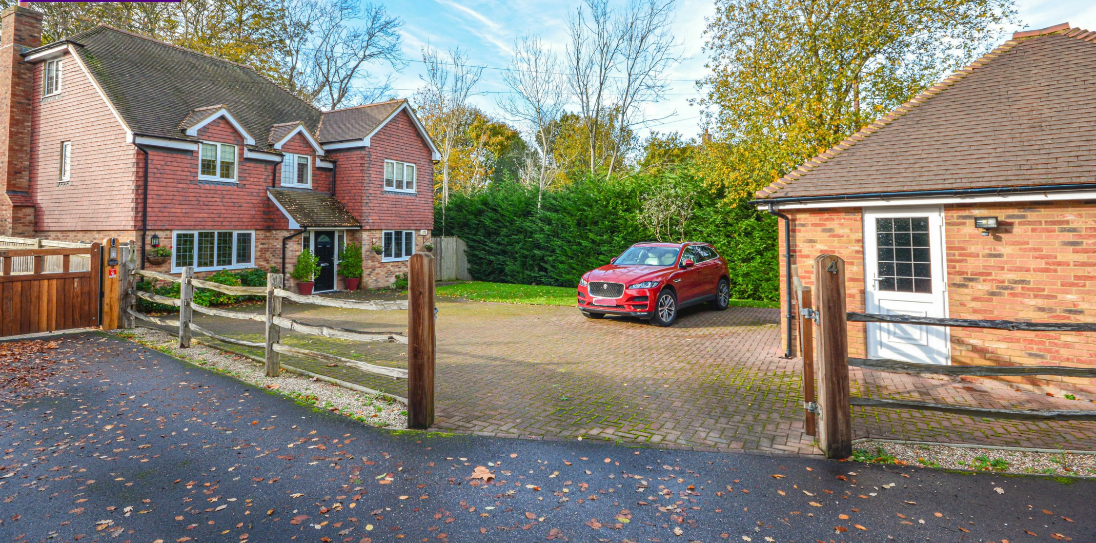
Oakwood House, 4 Kiln Close, Hellingly, East Sussex BN27 4EJ £695,000