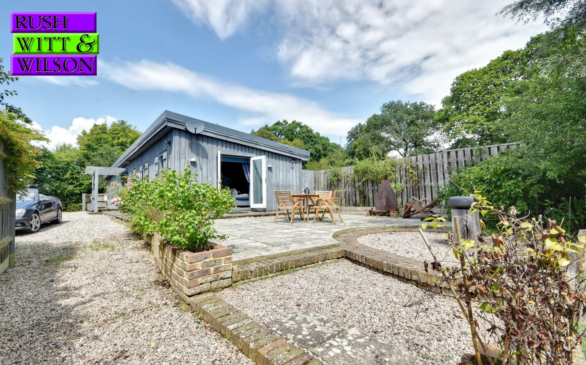
The Grey Barn Hunts Hill Farm,, Wittersham, Kent TN30 7PR Guide Price £450,000