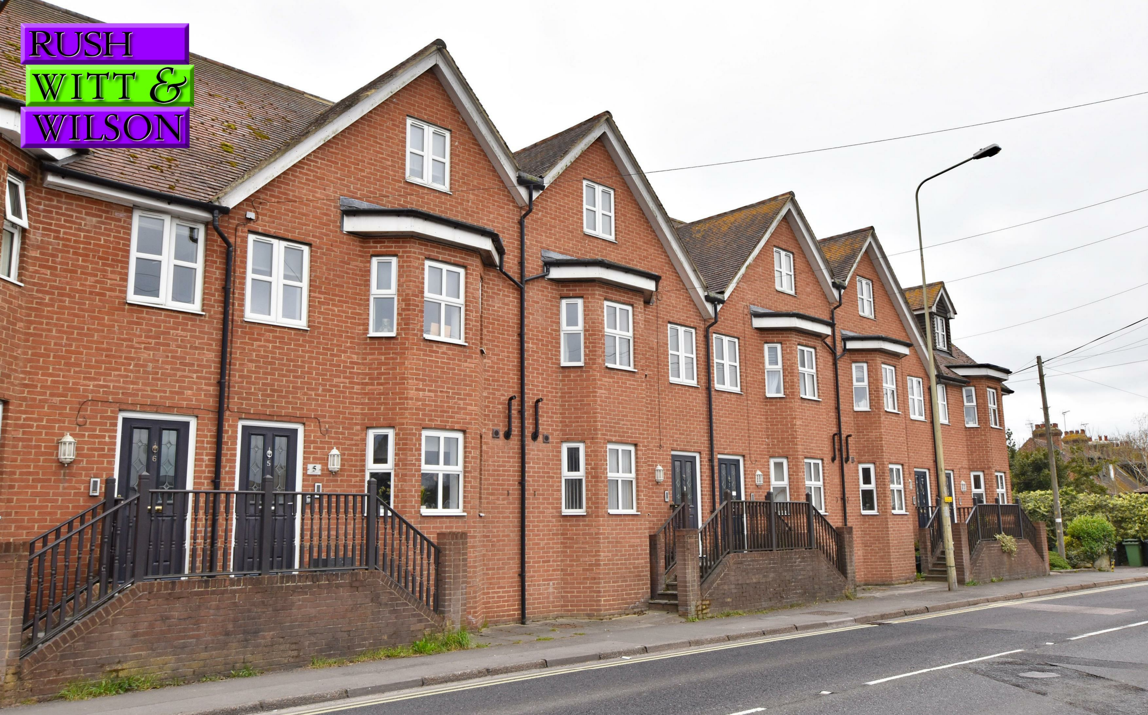
4 Quayside Court Winchelsea Road, Rye, East Sussex TN31 7EL Guide Price £425,000