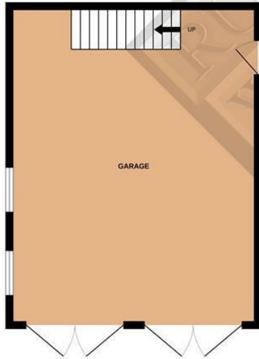
GARAGE GROUND FLOOR 440 sq.ft. (40.8 sq.m.) approx.