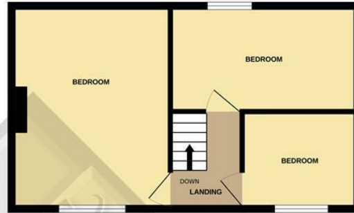
1ST FLOOR 386 sq.ft. (35.9 sq.m.) approx.