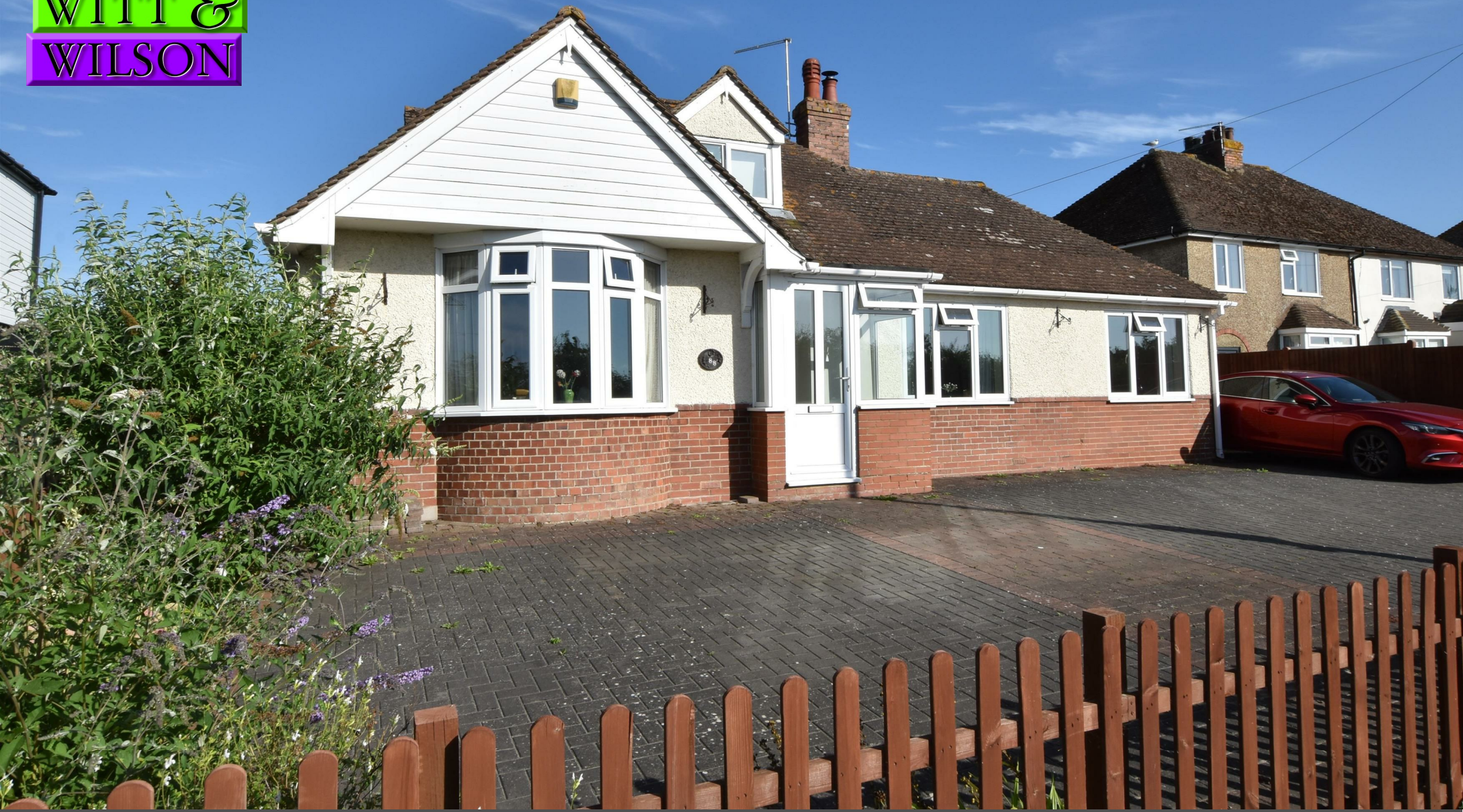
88 New Winchelsea Road, Rye, East Sussex TN31 7TA Guide Price £485,000