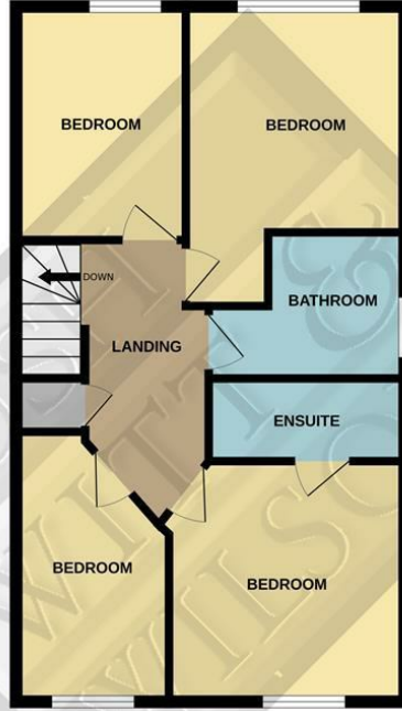
1ST FLOOR 573 sq.ft. (53.2 sq.m.) approx.