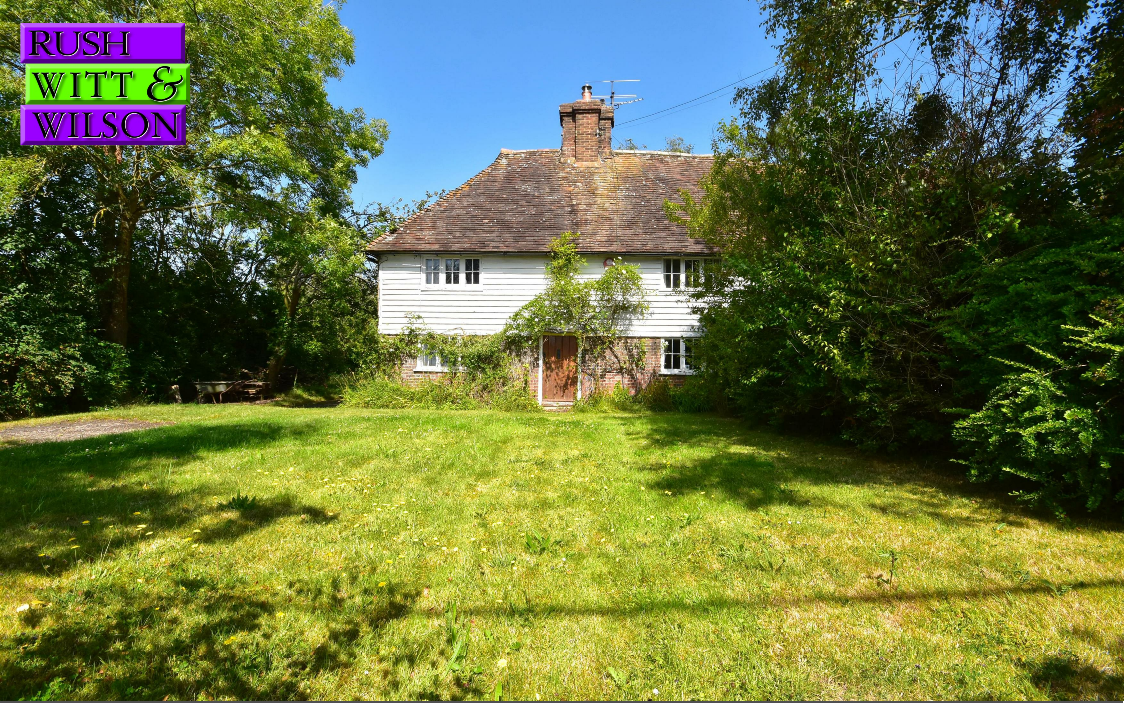
Chapel Cottage Stone in Oxney, Tenterden, TN30 7JL Guide Price £475,000