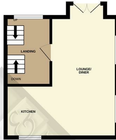
1ST FLOOR 296 sq.ft. (27.5 sq.m.) approx.