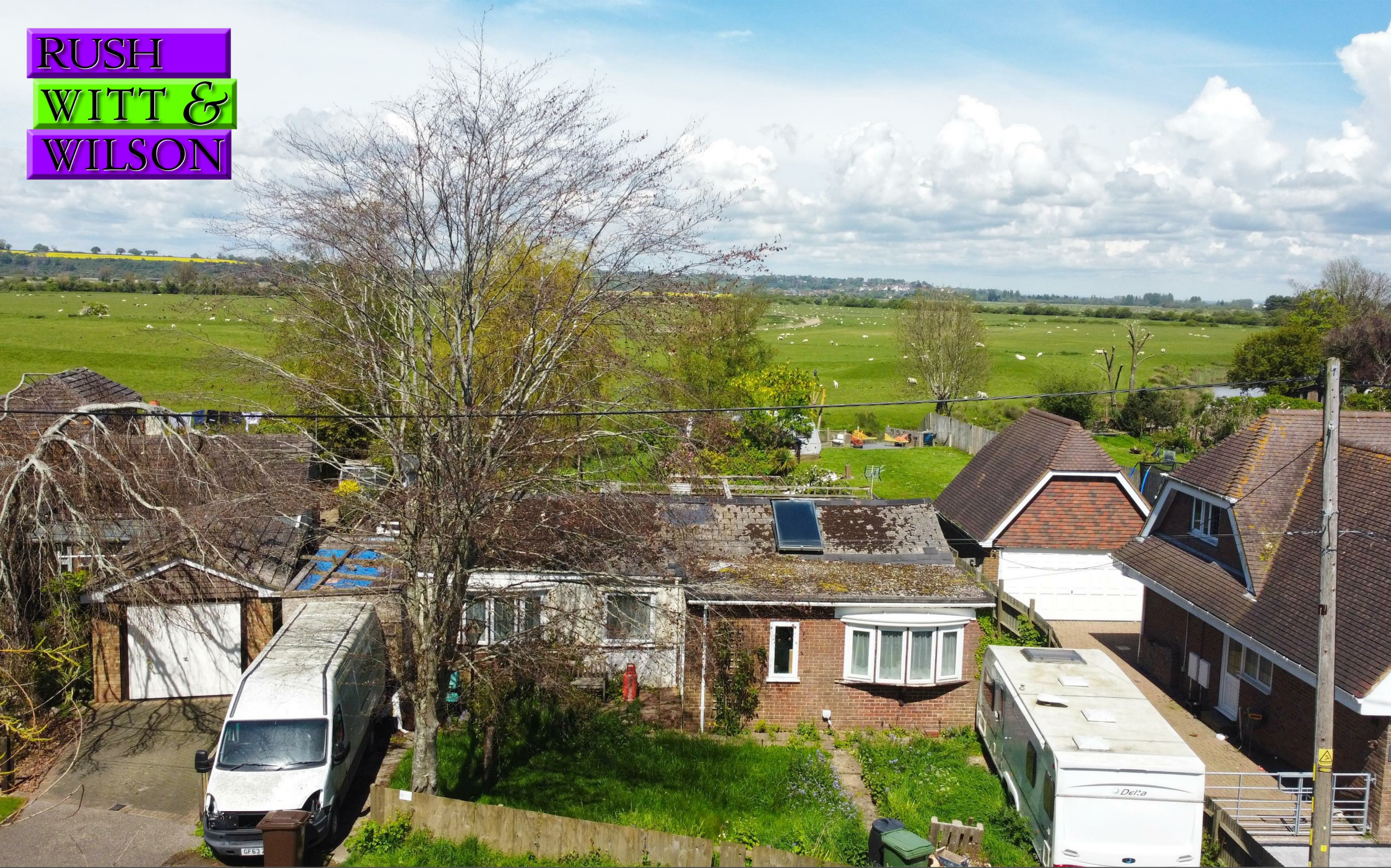
Willow Bank Cottage Sea Road, Winchelsea Beach, East Sussex TN36 4LA Guide Price £480,000