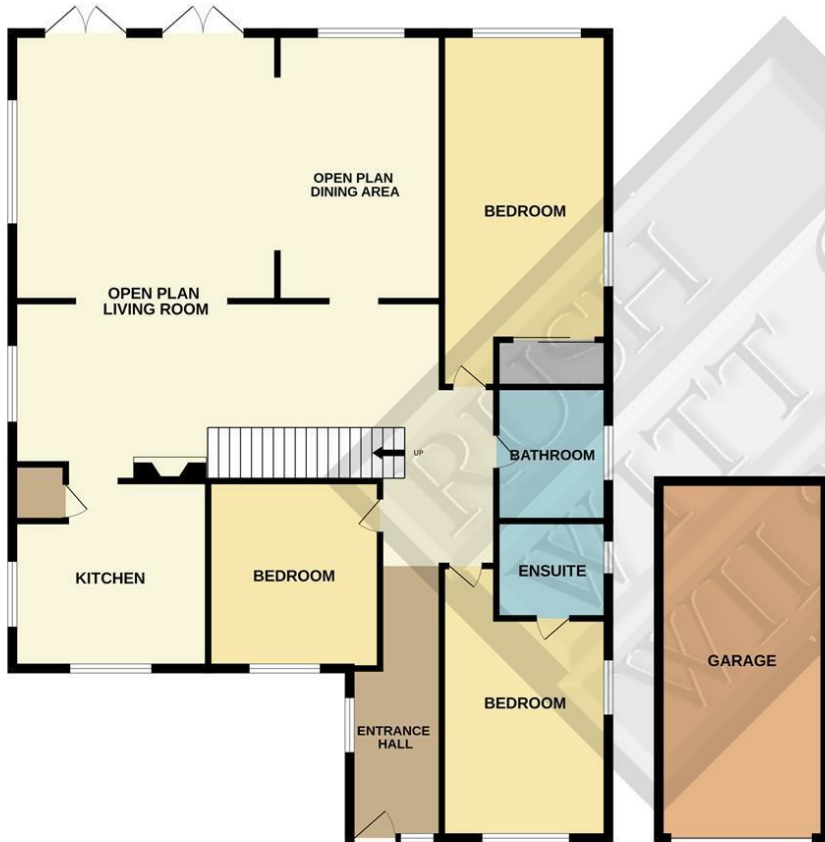
GROUND FLOOR 1774 sq.ft. (164.8 sq.m.) approx.