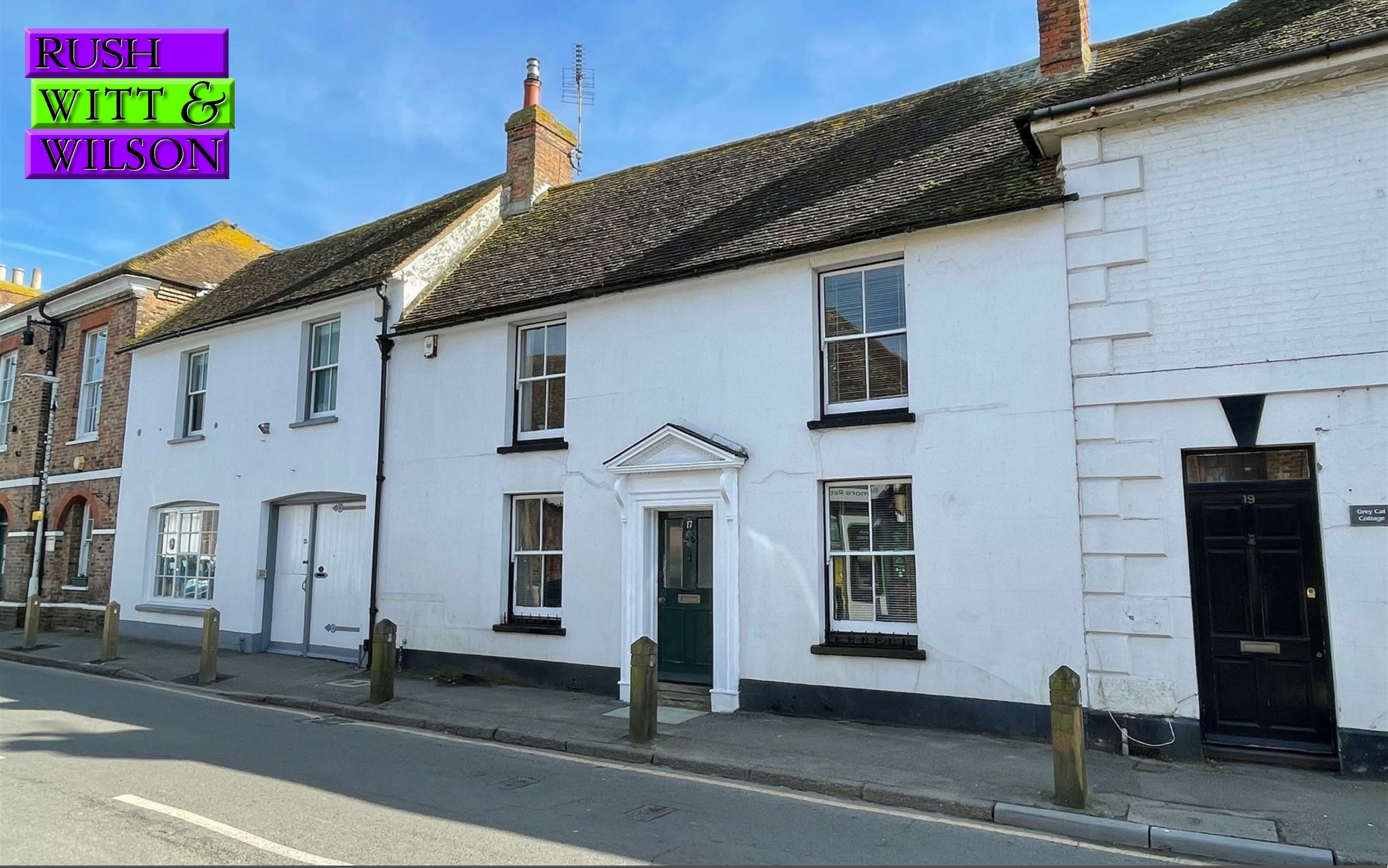
Forge House, 17 High Street, Lydd, Kent TN29 9AJ Guide Price £395,000