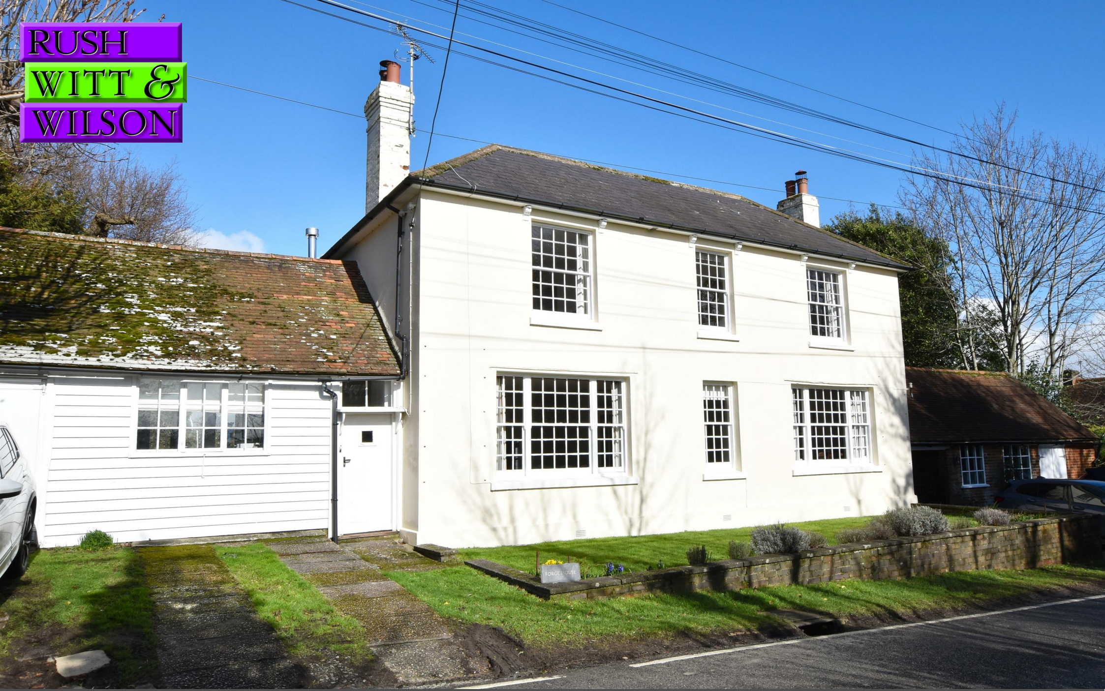
Forge House, Udimore Road, Udimore,, East Sussex TN31 6AY Guide Price £850,000