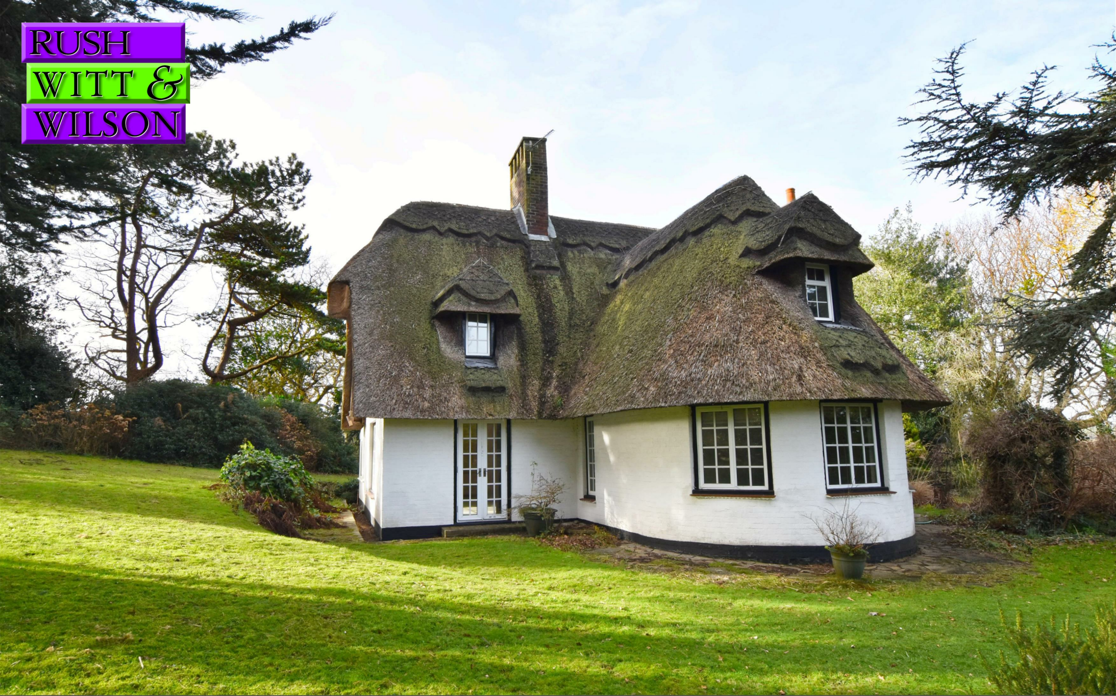
Little Thatches Cliff End Lane, Pett Level, East Sussex TN35 4EF Guide Price £695,000