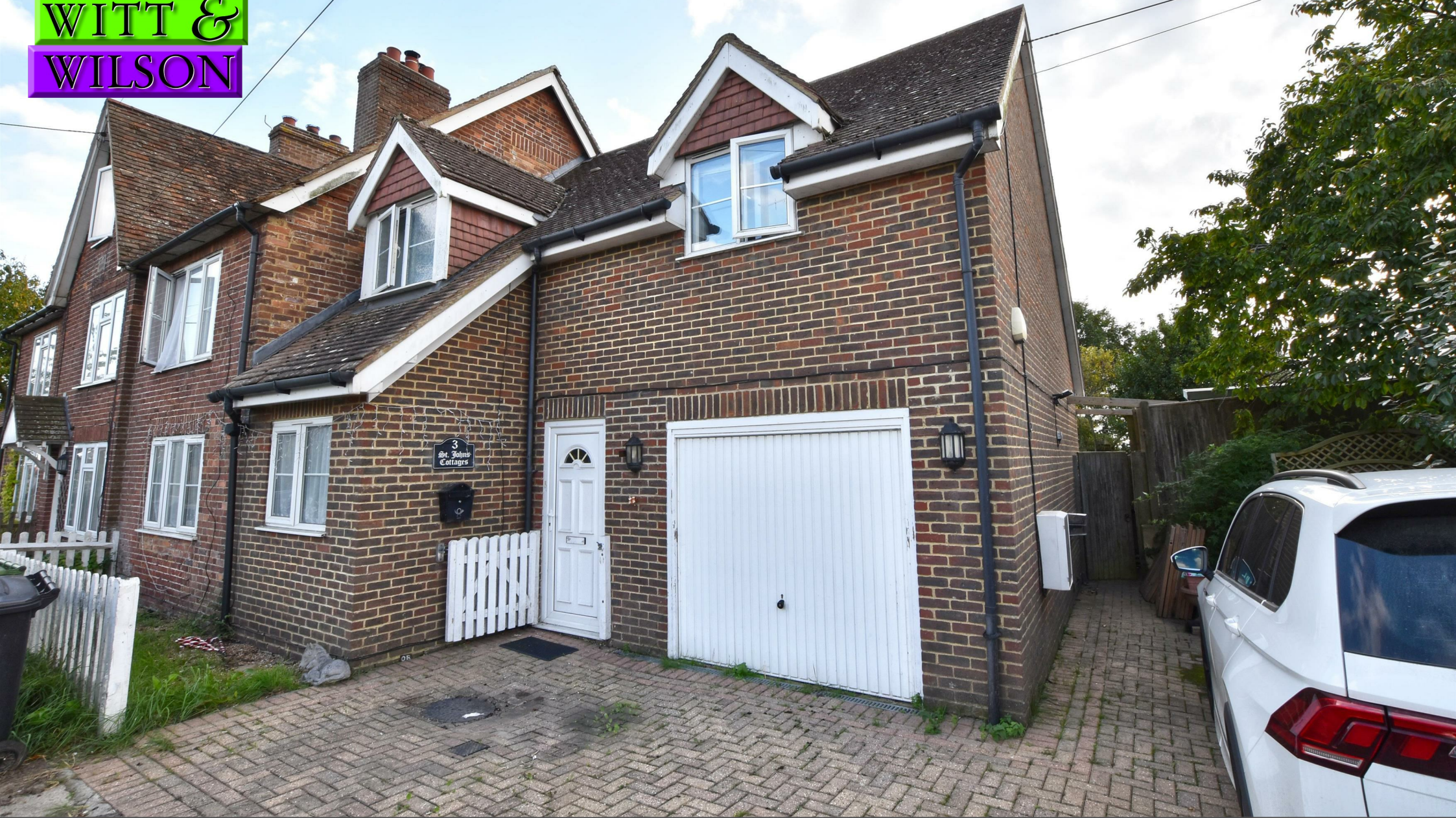
3 St Johns Cottages & adjoining plot of land , East Guldeford, Rye, TN31 7QH Guide Price £475,000