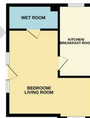
ANNEX 309 sq.ft. (28.7 sq.m.) approx.