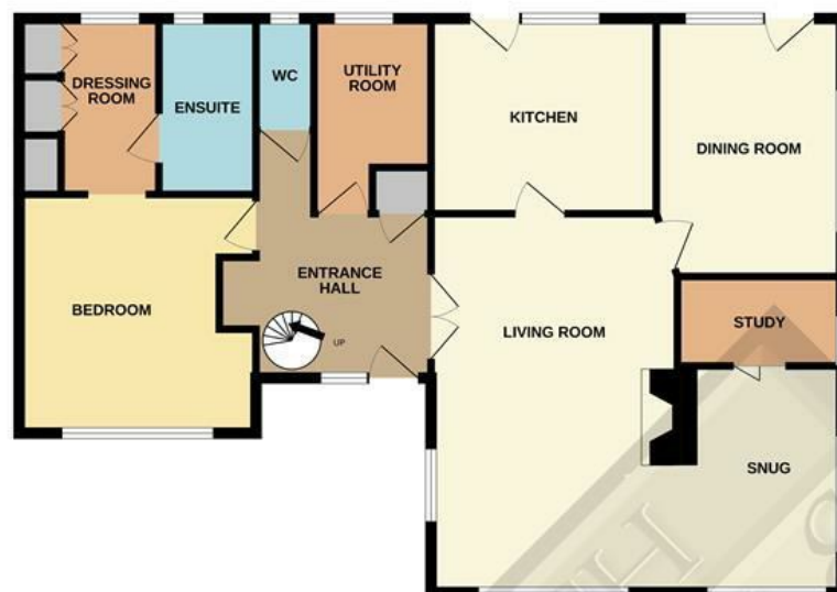
GROUND FLOOR 1022 sq.ft. (94.9 sq.m.) approx.