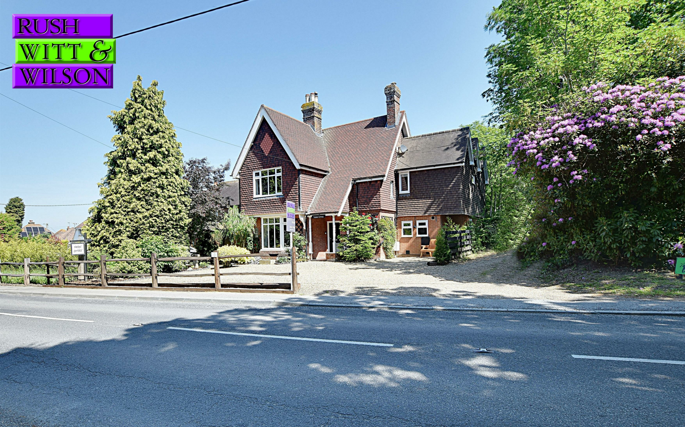
Thorne Cottage Ninfield Road, Bexhill-On-Sea, East Sussex TN39 5JJ £620,000