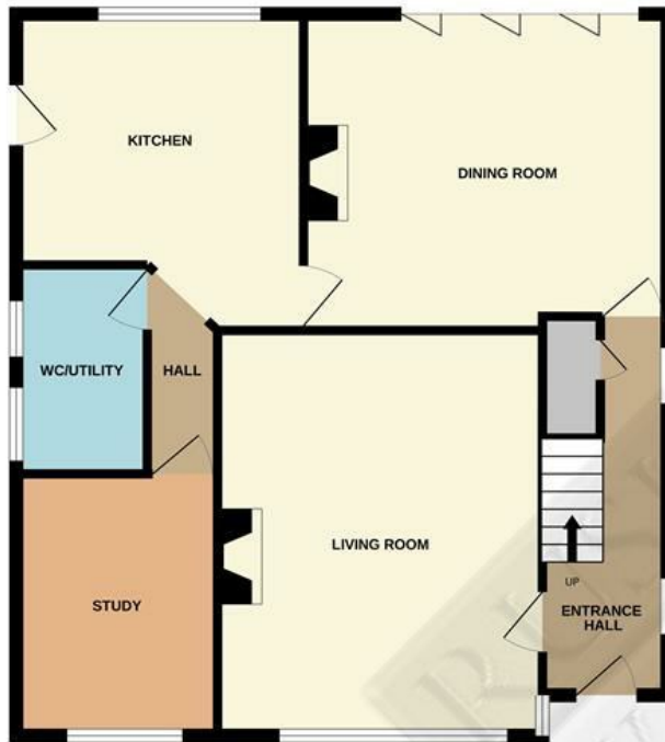
GROUND FLOOR 790 sq.ft. (73.4 sq.m.) approx.