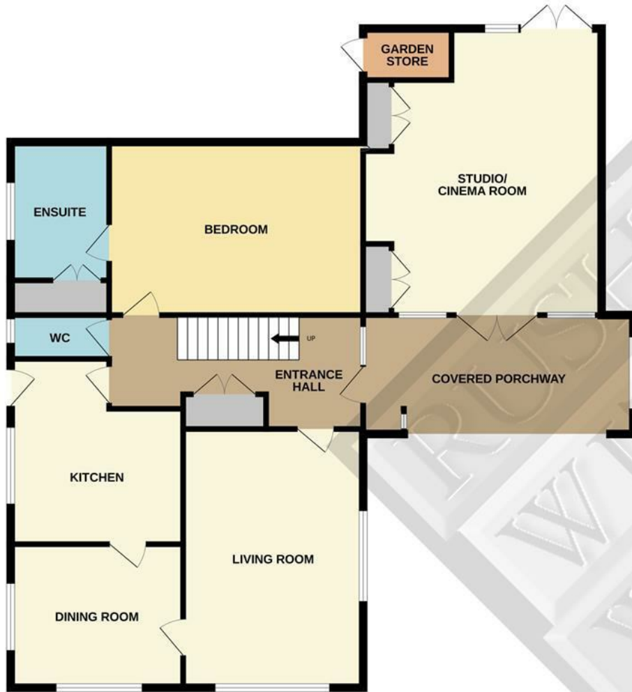
GROUND FLOOR 1403 sq.ft. (130.3 sq.m.) approx.