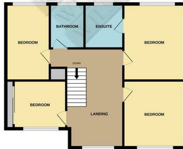
TOTAL FLOOR AREA : 1481 sq.ft. (137.6 sq.m.) approx.

Whilst every attempt has been made to ensure the accuracy of the floorplan contained here, measurements of doors, windows, rooms and any other items are approximate and no responsibility is taken for any error, omission or mis-statement. This plan is for illustrative purposes only and should be used as such by any prospective purchaser. The services, systems and appliances shown have not been tested and no guarantee as to their operability or efficiency can be given. Made with Metropix ©2022