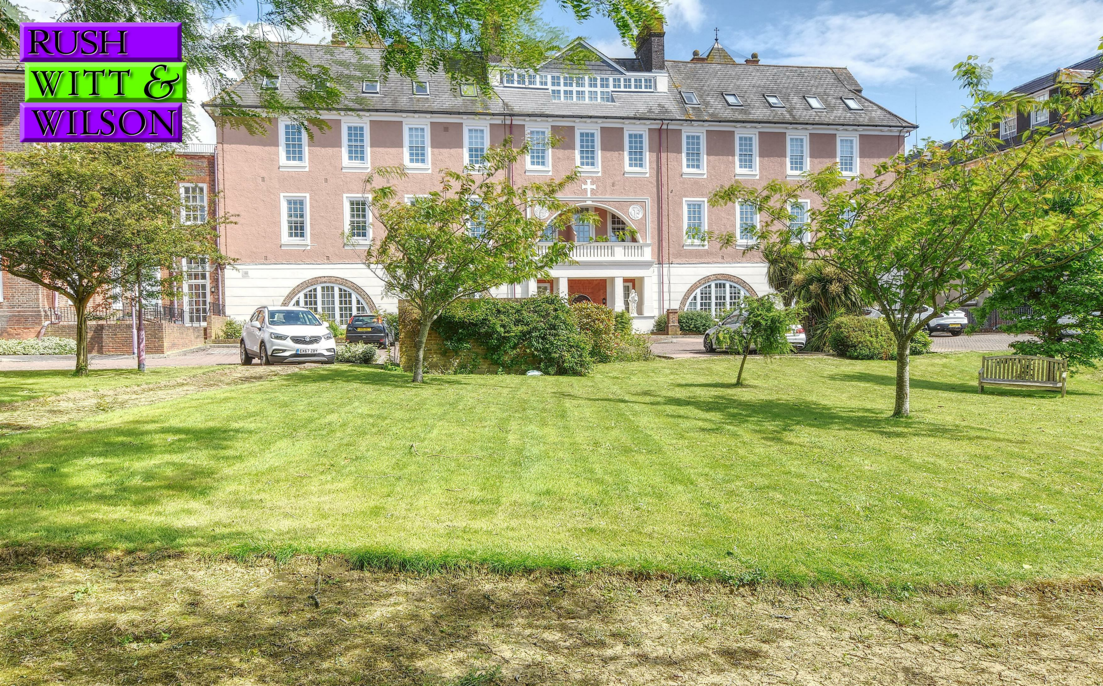
5 St James House James Walk, Bexhill-On-Sea, TN40 2JZ £239,000