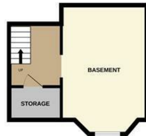
BASEMENT 267 sq.ft. (24.8 sq.m.) approx.