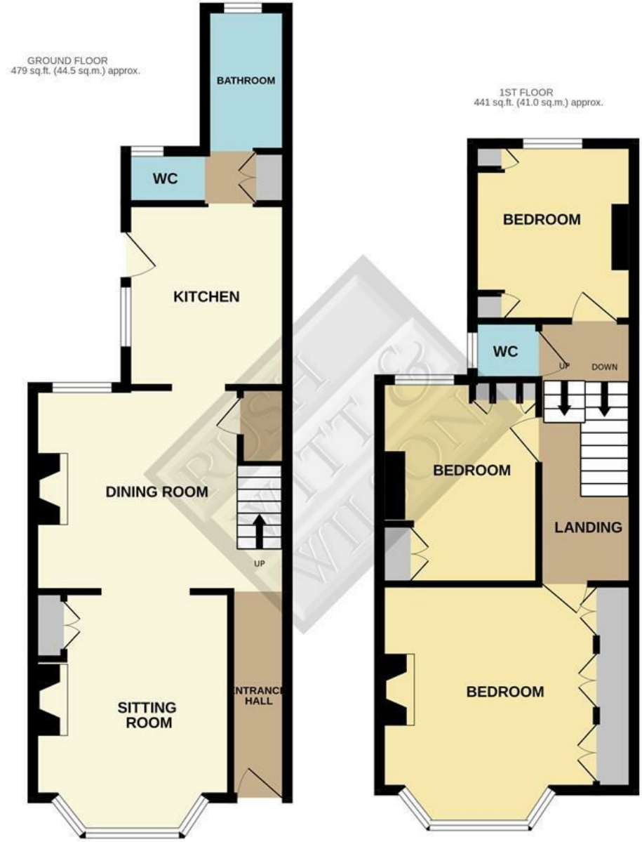
GROUND FLOOR 479 sq.ft. (44.5 sq.m.) approx.