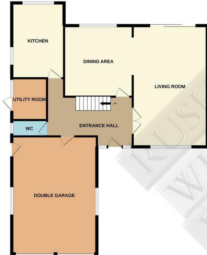
GROUND FLOOR 1177 sq.ft. (109.3 sq.m.) approx.