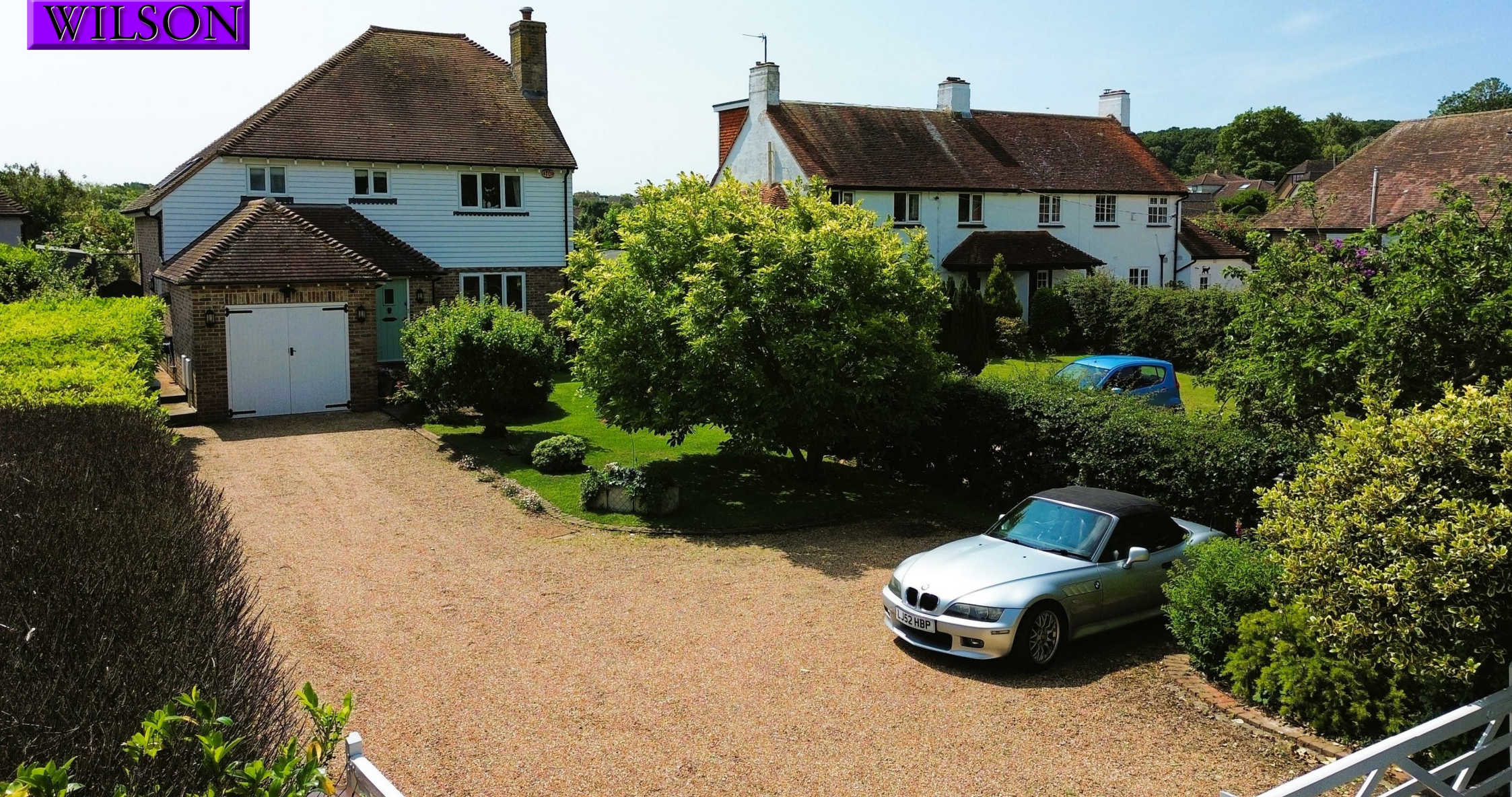
Meadow Cottage Pett Level Road, Hastings, East Sussex TN35 4EA £650,000 Freehold