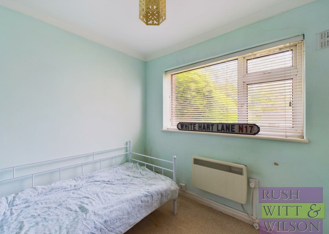
RUSH WITT & WILSON