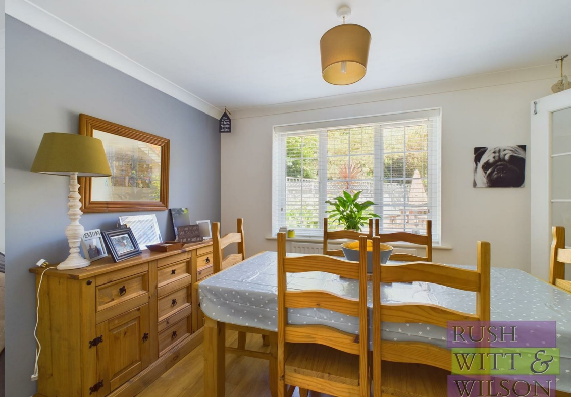
RUSH WITT & WILSON