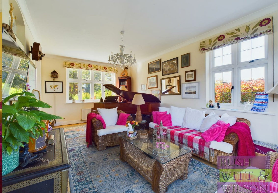
RUSH WITT & WILSON