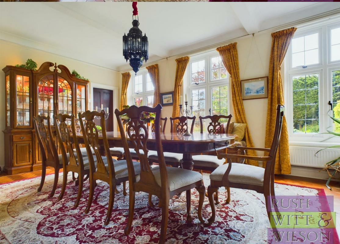
RUSH WITT & WILSON