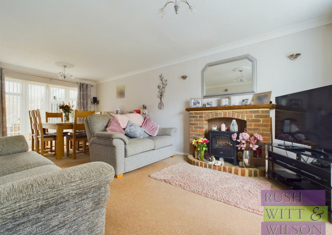
RUSH WITT & WILSON