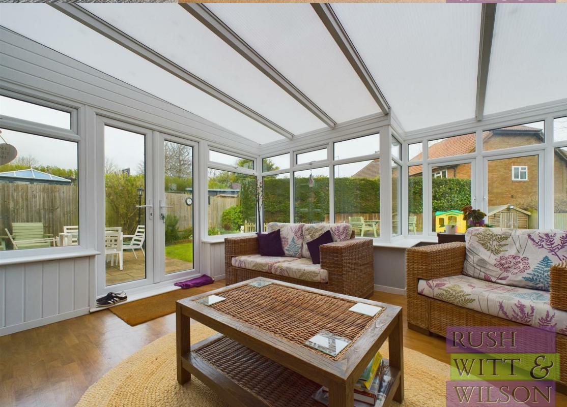
RUSH WITT & WILSON