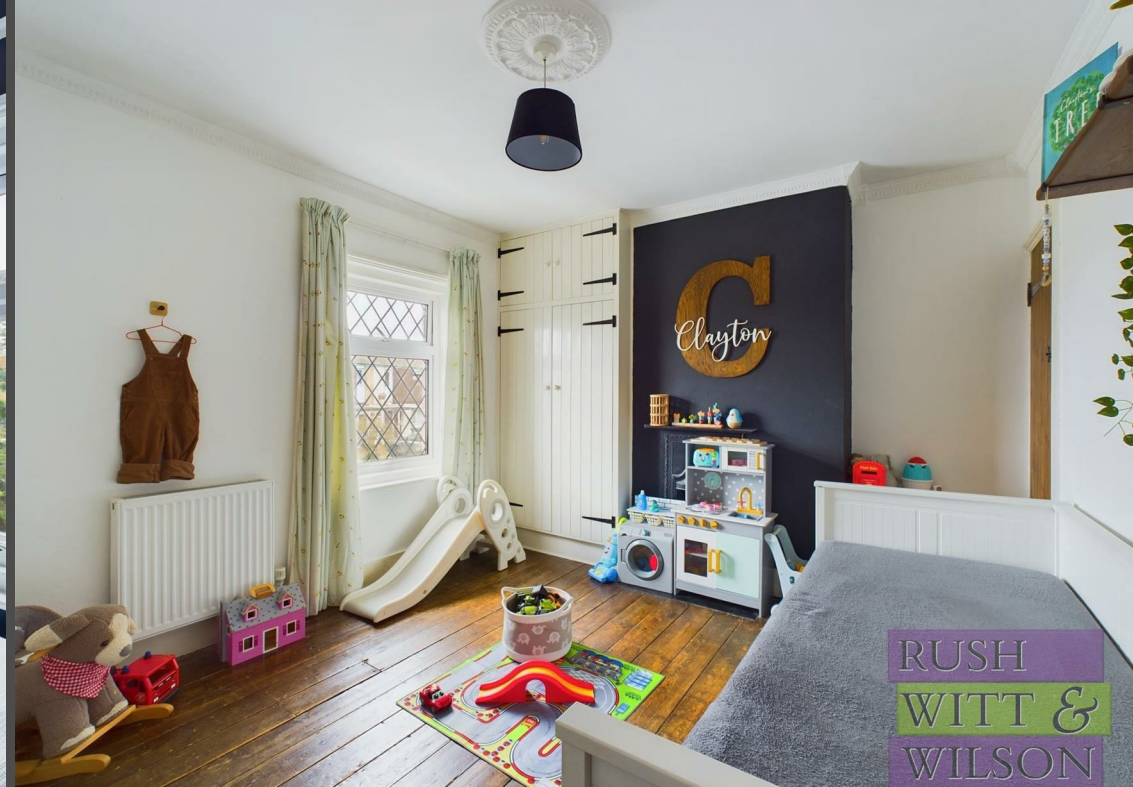
RUSH WITT & WILSON