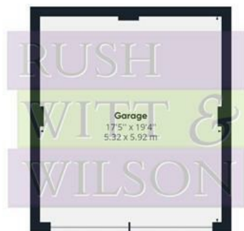
Floor 0 Building 2