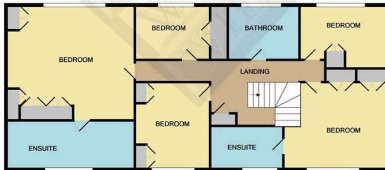
1ST FLOOR APPROX. FLOOR AREA 1063 SQ.FT. (98.7 SQ.M.)

TOTAL APPROX. FLOOR AREA 2933 SQ.FT. (272.5 SQ.M.)