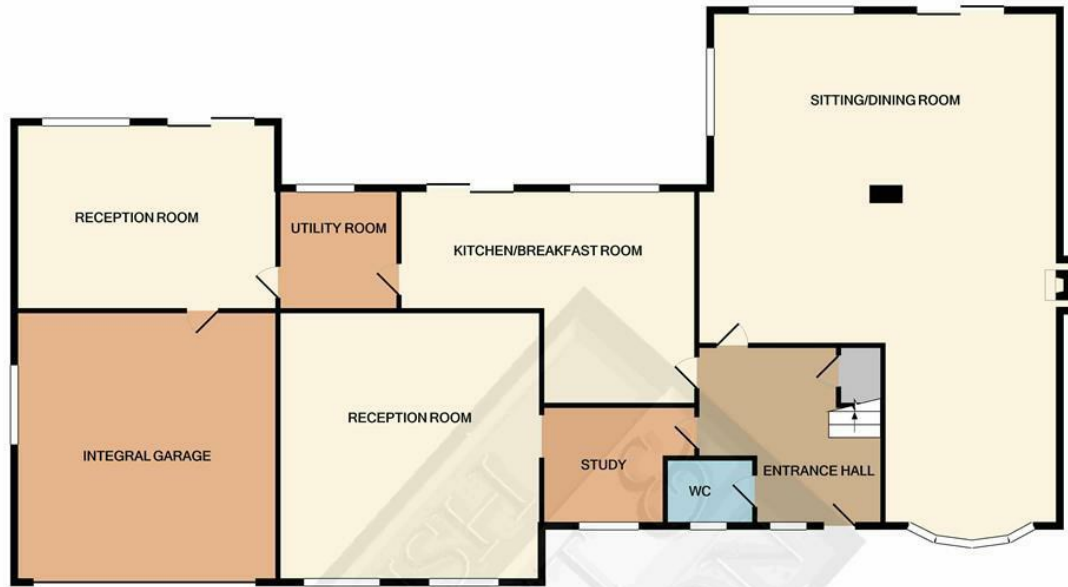
GROUND FLOOR APPROX. FLOOR AREA 1871 SQ.FT. (173.8 SQ.M.)