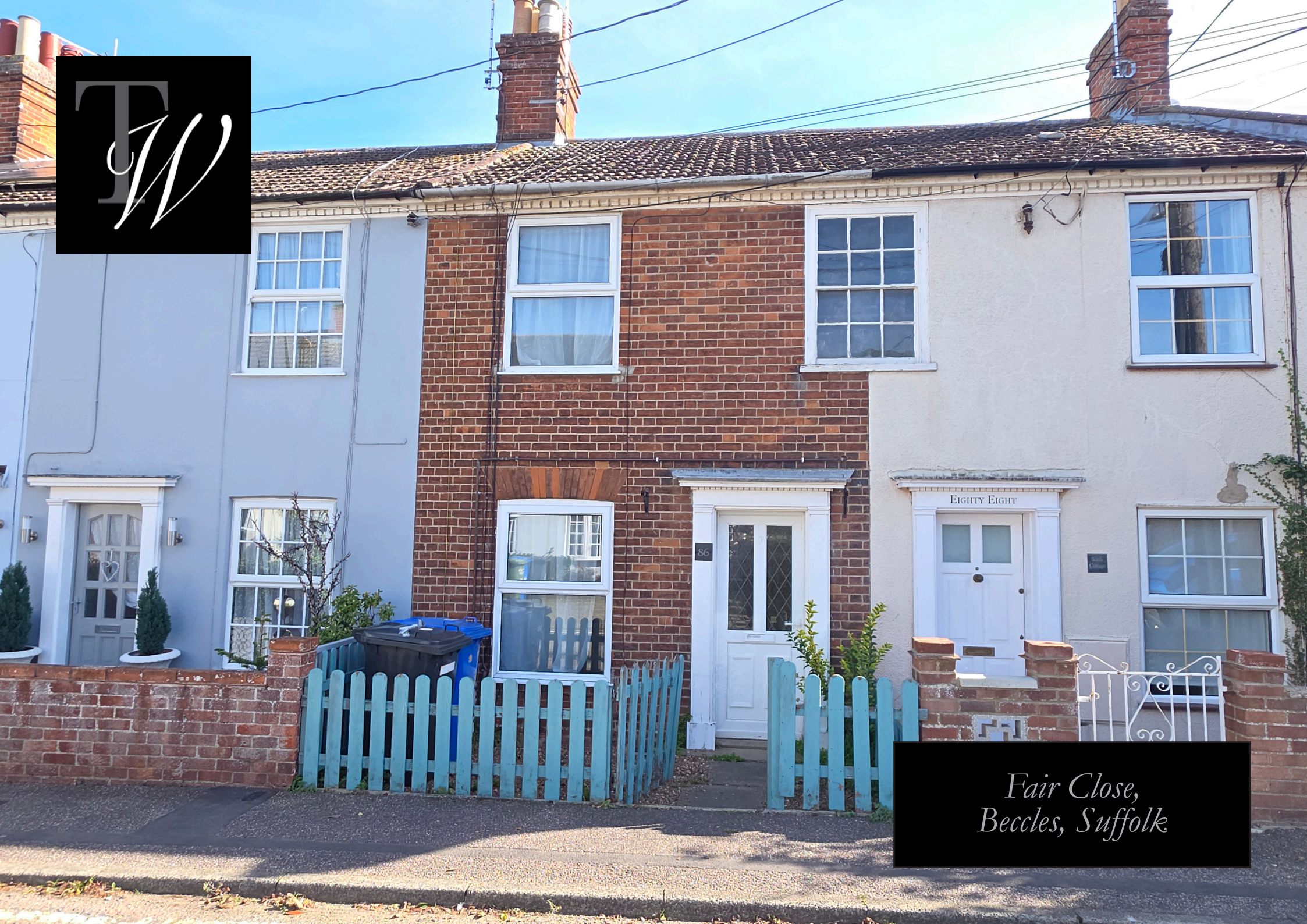
Fair Close, Beccles, Suffolk