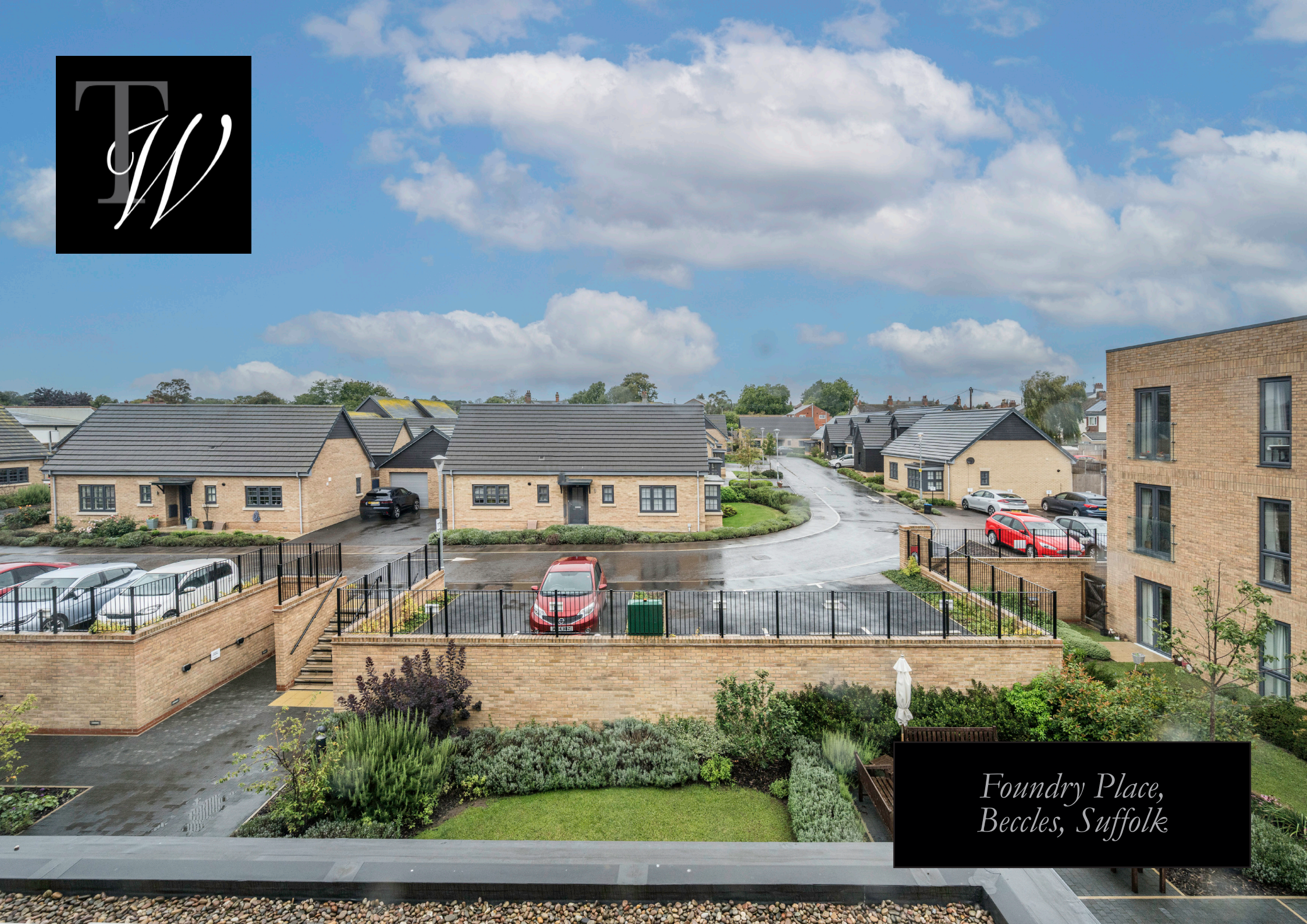
Foundry Place, Beccles, Suffolk