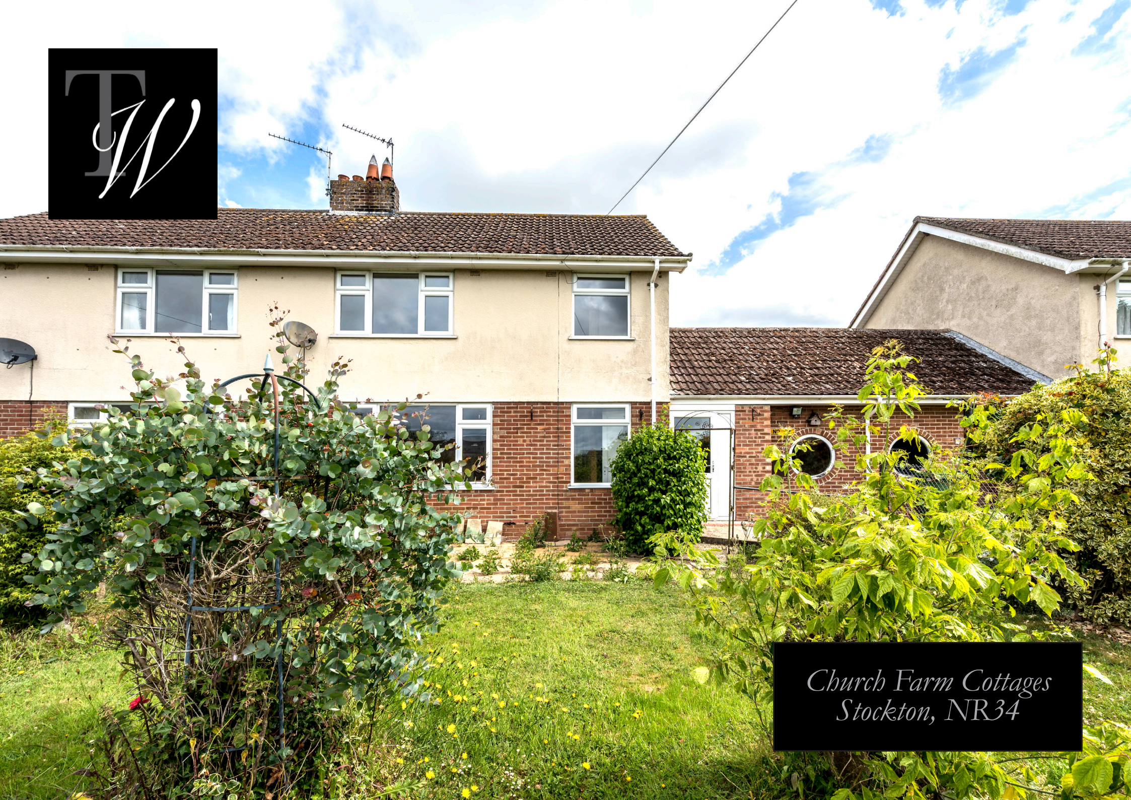
Church Farm Cottages Stockton, NR34