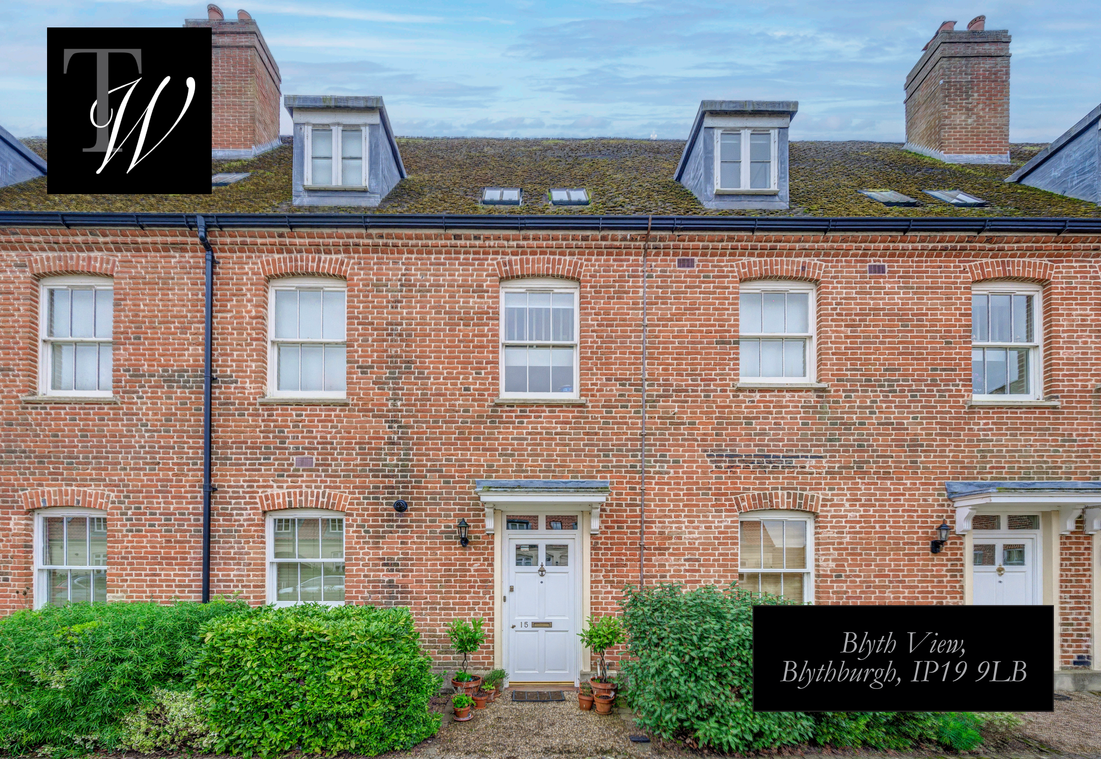
Blyth View, Blythburgh, IP19 9LB