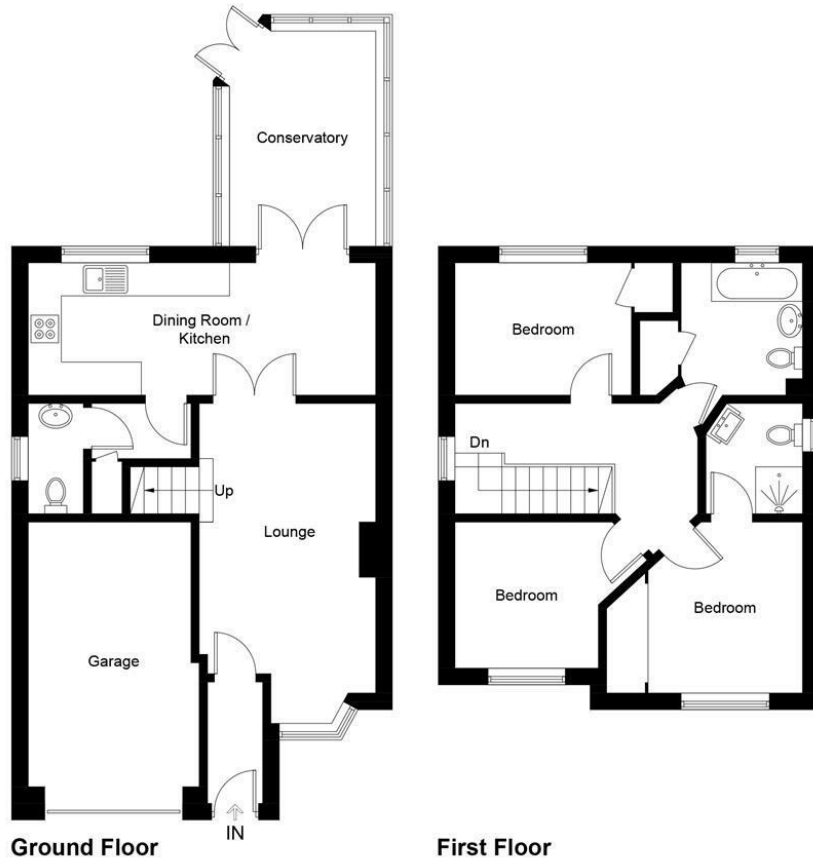
Illustration for identification purposes only, measurements are approximate, not to scale. floorplansUsketch.com © (ID1113330)

Approximate Gross Internal Area = 100.7 sq m / 1084 sq ft Garage = 15.4 sq m / 166 sq ft Total = 116.1 sq m / 1250 sq ft