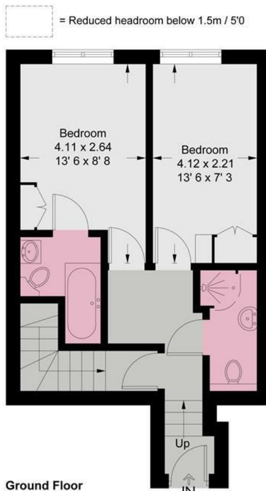
Ground Floor 390 sq ft / 36.2 sq m

This plan is not to scale and must be used as layout guidance only. All measurements and areas are approximate and should not be relied upon to provide accurate information. This plan must not be relied upon when making property valuations, design considerations or any other such relevant decisions. We accept no responsibility or liability (whether in contract, tort or otherwise) in relation to any loss whatsoever arising from or in connection with any use of this plan or the adequacy, accuracy or completeness of it or any information within it.