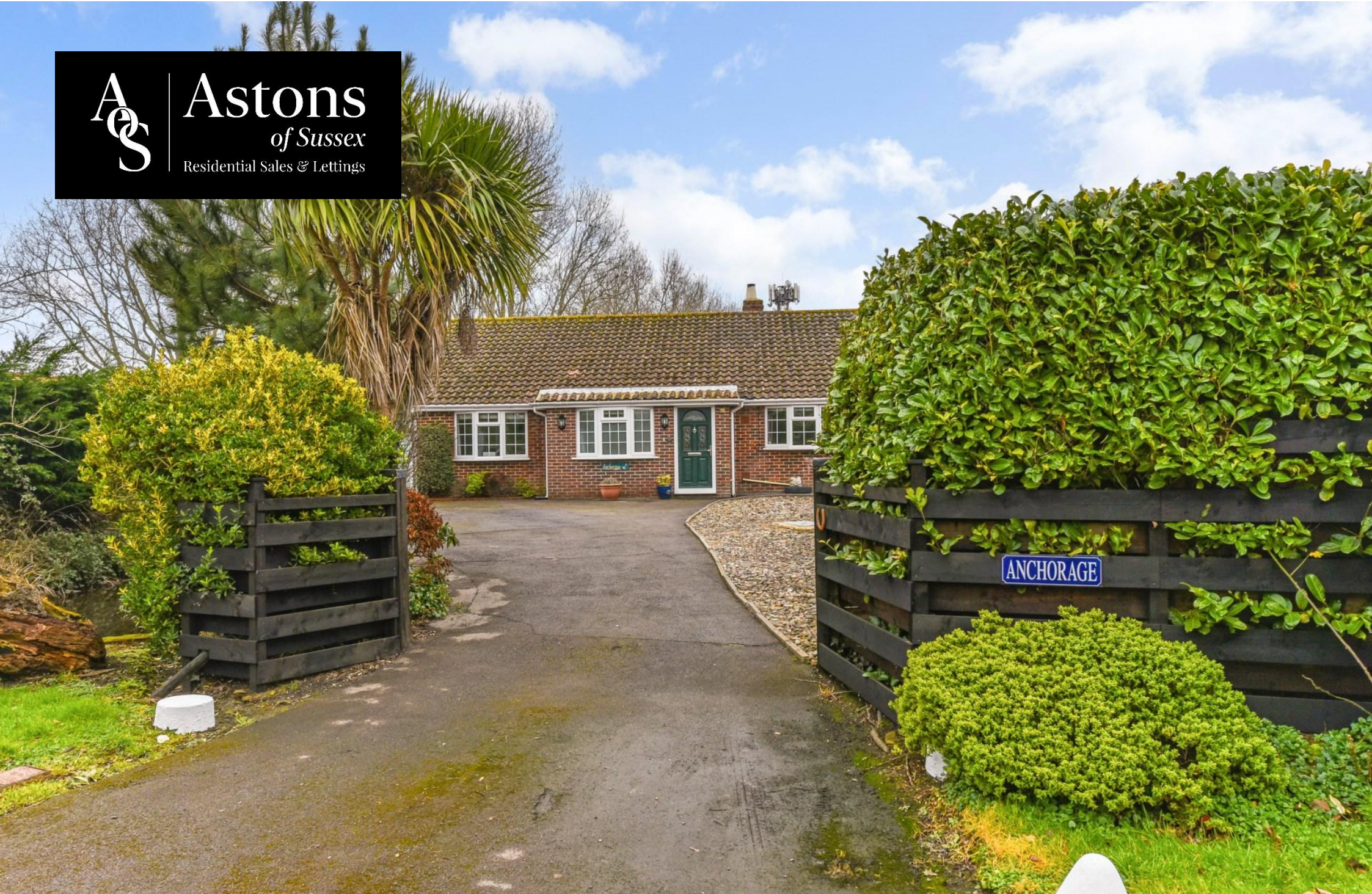
Anchorage, Bracklesham Lane, Bracklesham Bay, PO20 8JF

Astons of Sussex Residential Sales & Lettings