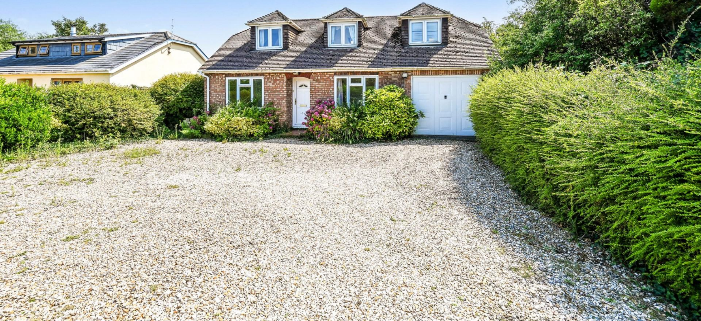
Pine Croft, Bracklesham Lane, PO20 7JE

Astons of Sussex Residential Sales & Lettings