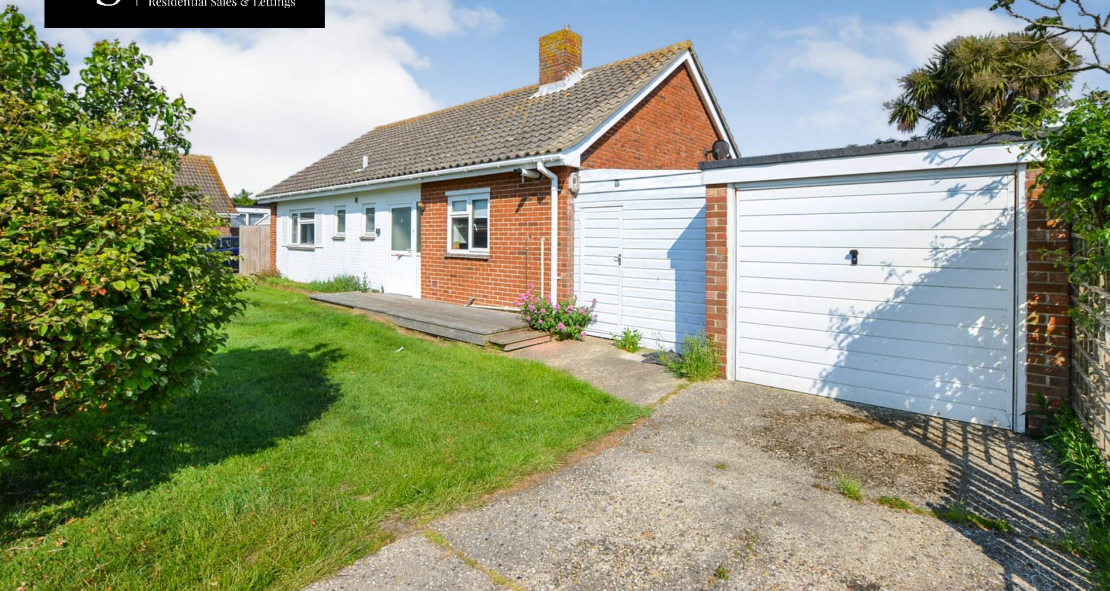
Silvermist, 8 Culimore Close, PO20 8HD

Astons of Sussex Residential Sales & Lettings