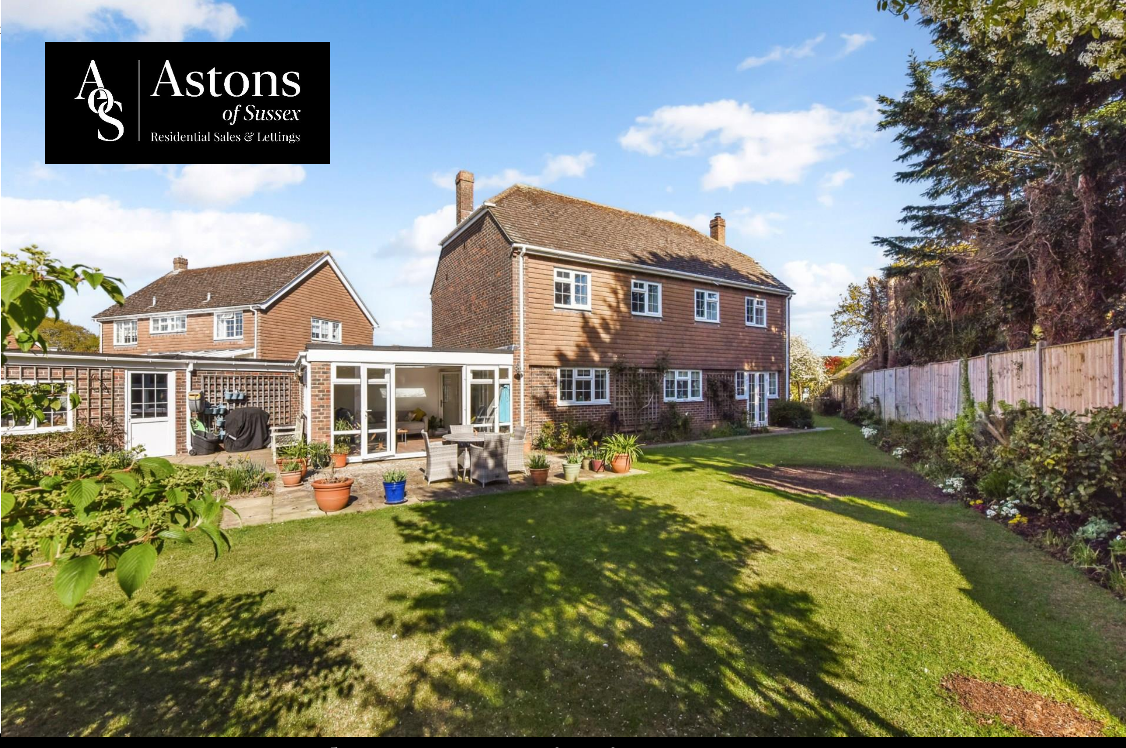
9 Elms Way, West Wittering, PO20 8LS