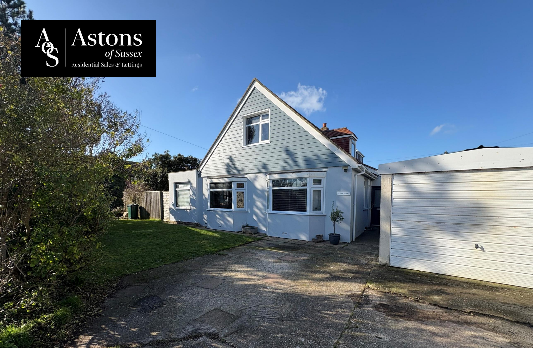
Sunflowers, Kimbridge Road, PO20 8PE

Astons of Sussex Residential Sales & Lettings