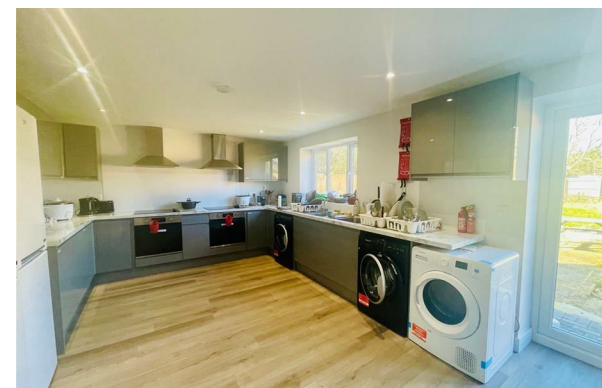
Room 4, 53 Buckingham Road, Bicester, OX26 3EY £1,095 (From) PCM - 1st July 2025.