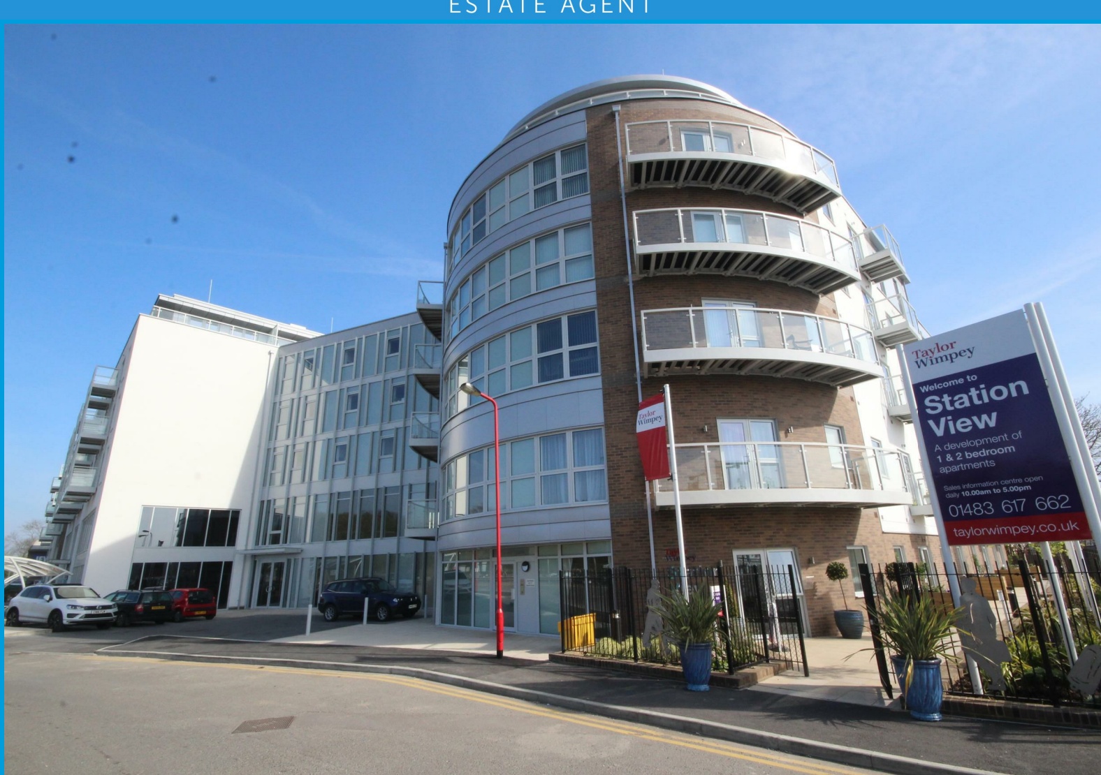
Austen House, Station View Guildford, Surrey GU1 4AX