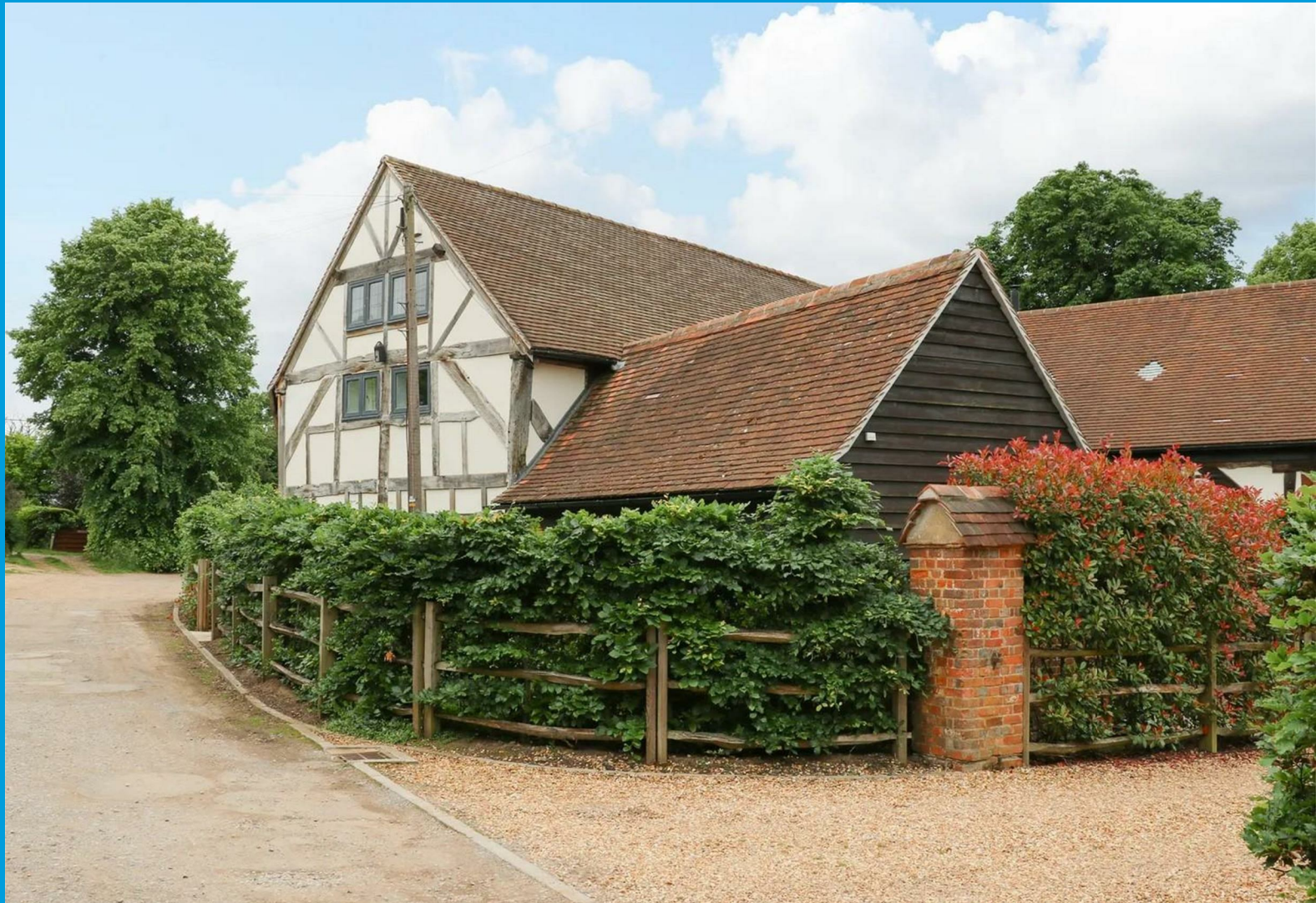
Great Tangle Barn, Great Tangle Wonerish, Guildford GU5 0PT