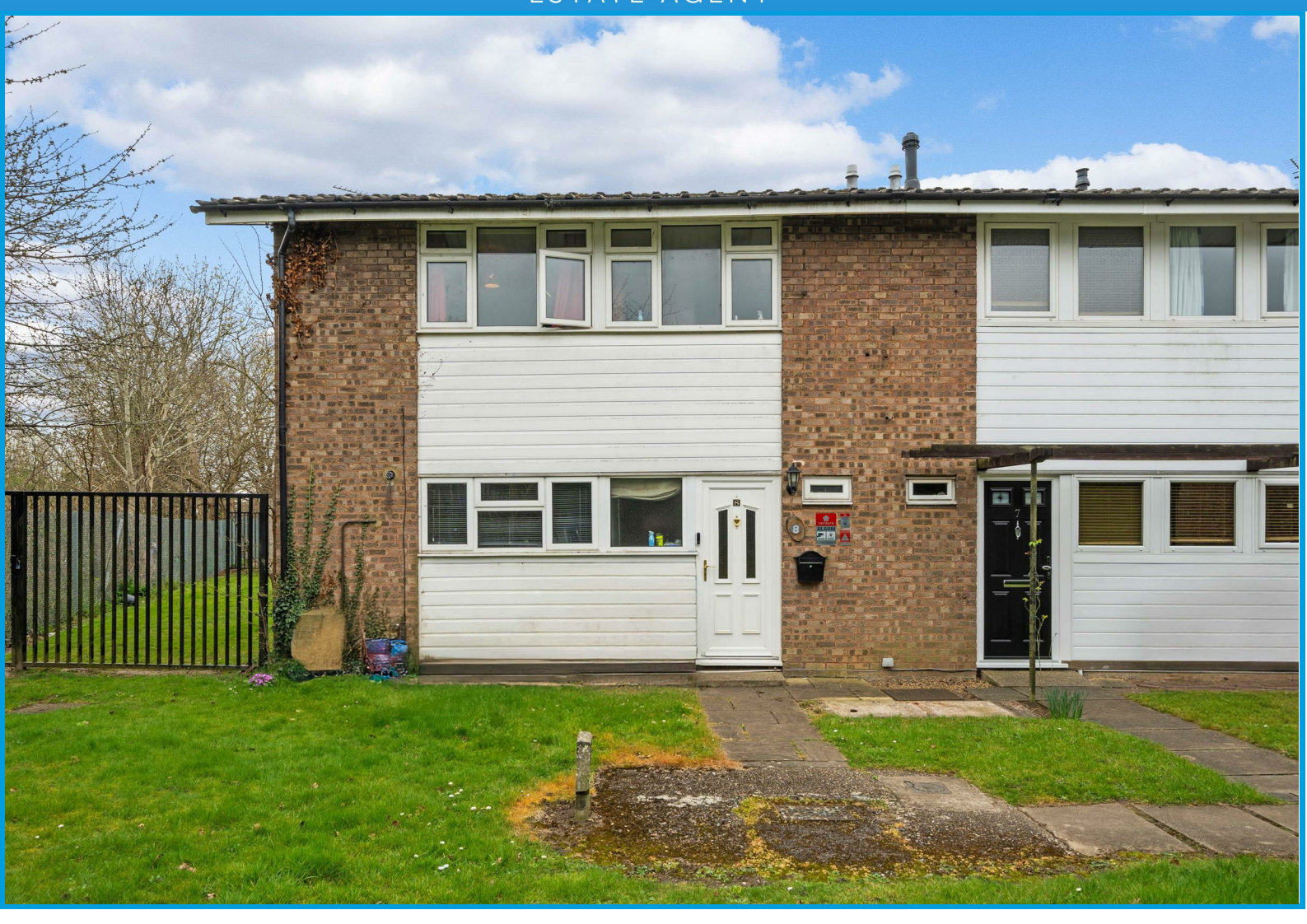
Robin Way, Guildford, GU2 9QR