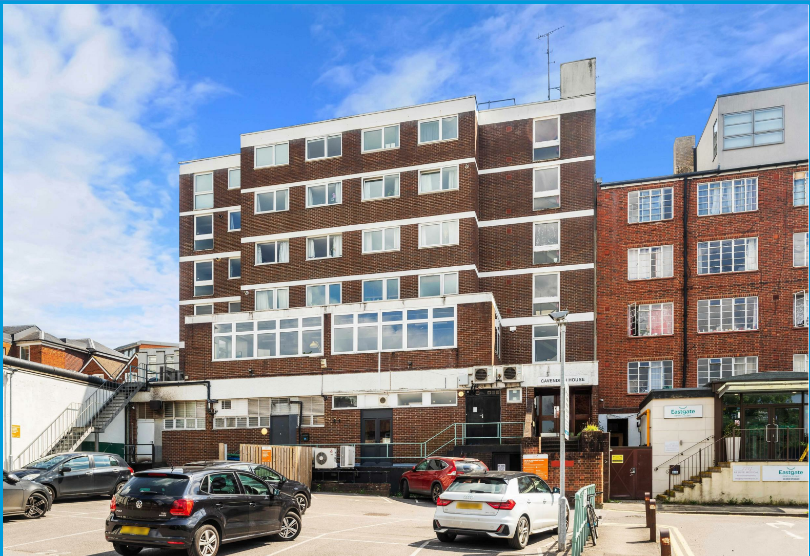
Cavendish House, Eastgate Gardens Guildford, Surrey GU1 4AY