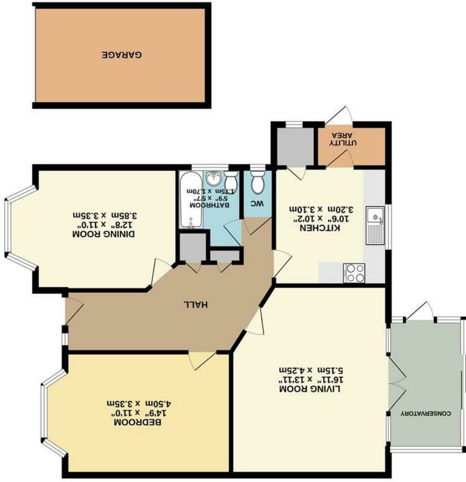
GROUND FLOOR (102.7 sq.m.) approx. 1106 sq.ft.