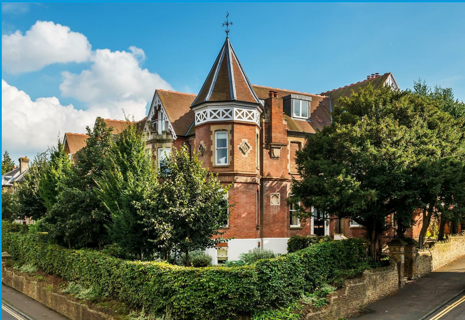
Turret House, 1 Jenner Road Guildford, Surrey GU1 3PH