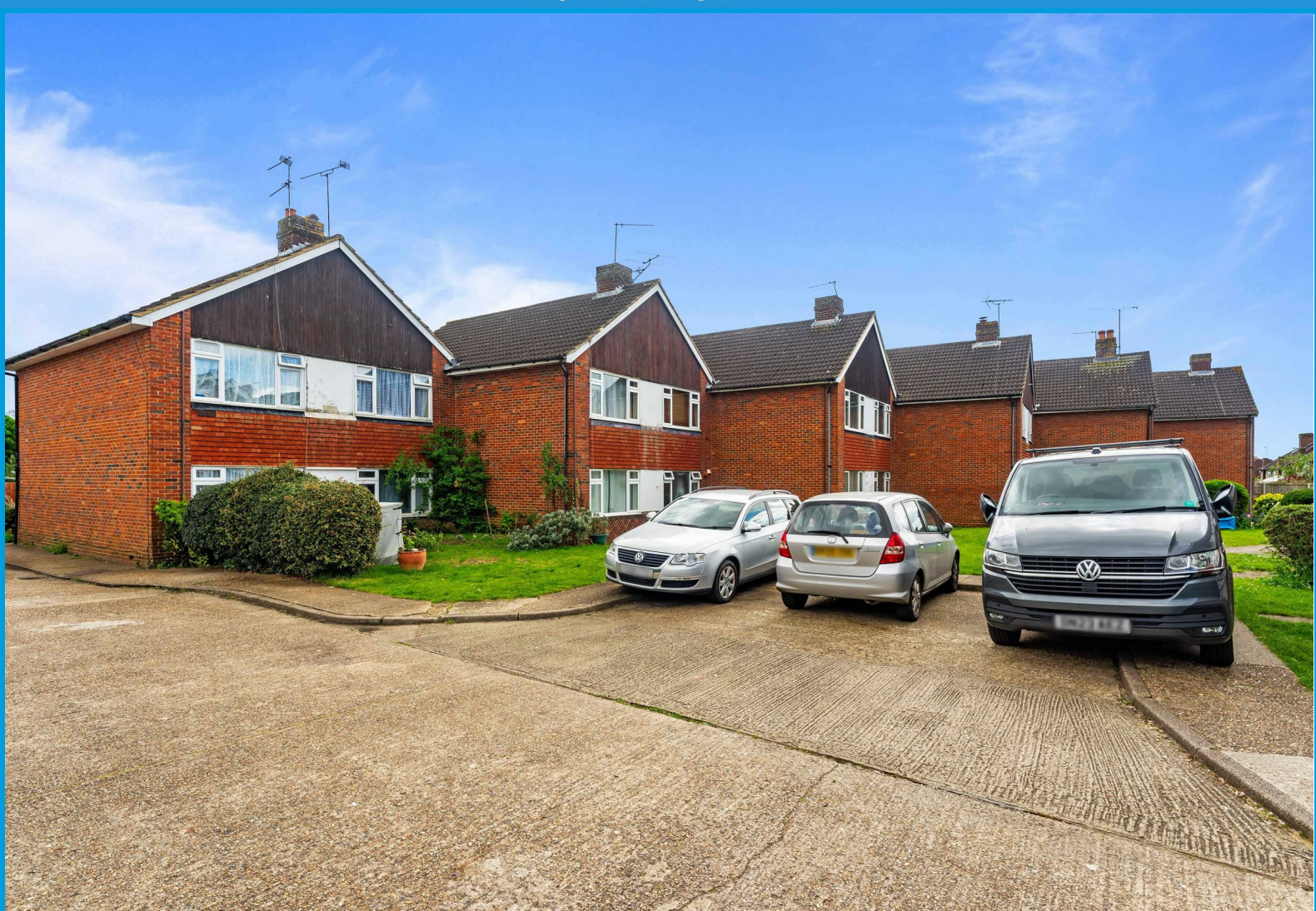
Manor Lodge, Guildford, GU2 9NH